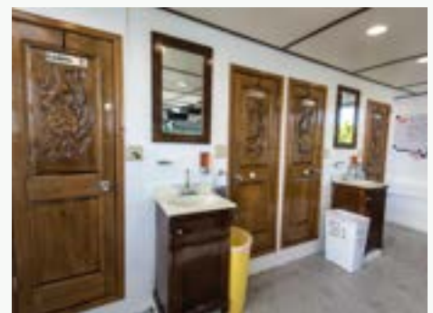
QUINO EL GUARDIAN BOAT / CABIN LAYOUT Cabins 1-4 have two upper and two lower bunks - Cabin 5 has one upper and one lower bunk.